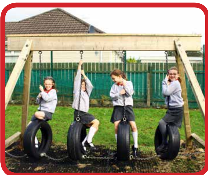
Children enjoying outdoor play